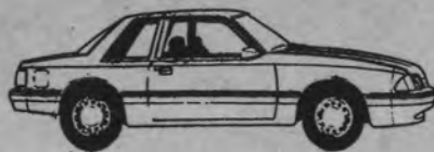
1987 FORD MUSTANG